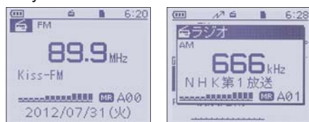
FM broadcast receive AM + dualwatch receive * Showing Japan version screen shots.

FM, AM and shortwave broadcast stations can be listened to, while using the dualwatch function for monitoring ham bands. When a ham band signal is received, the broadcast station is automatically muted.